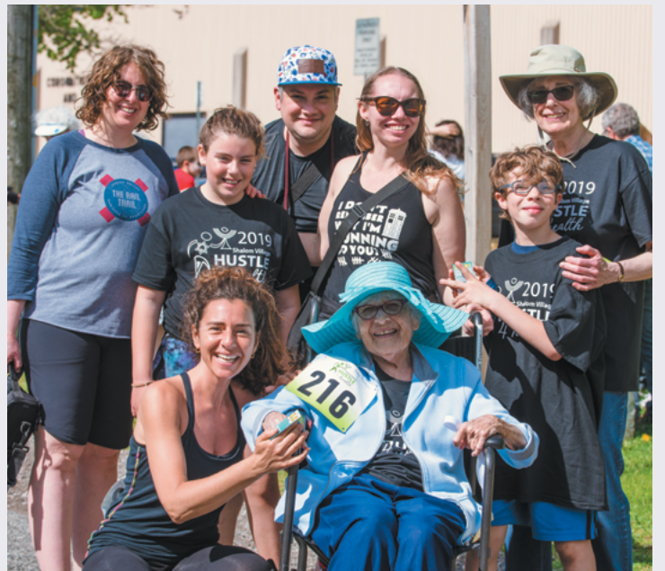
Hustle 4 Health participants, supporting seniors and celebrating families