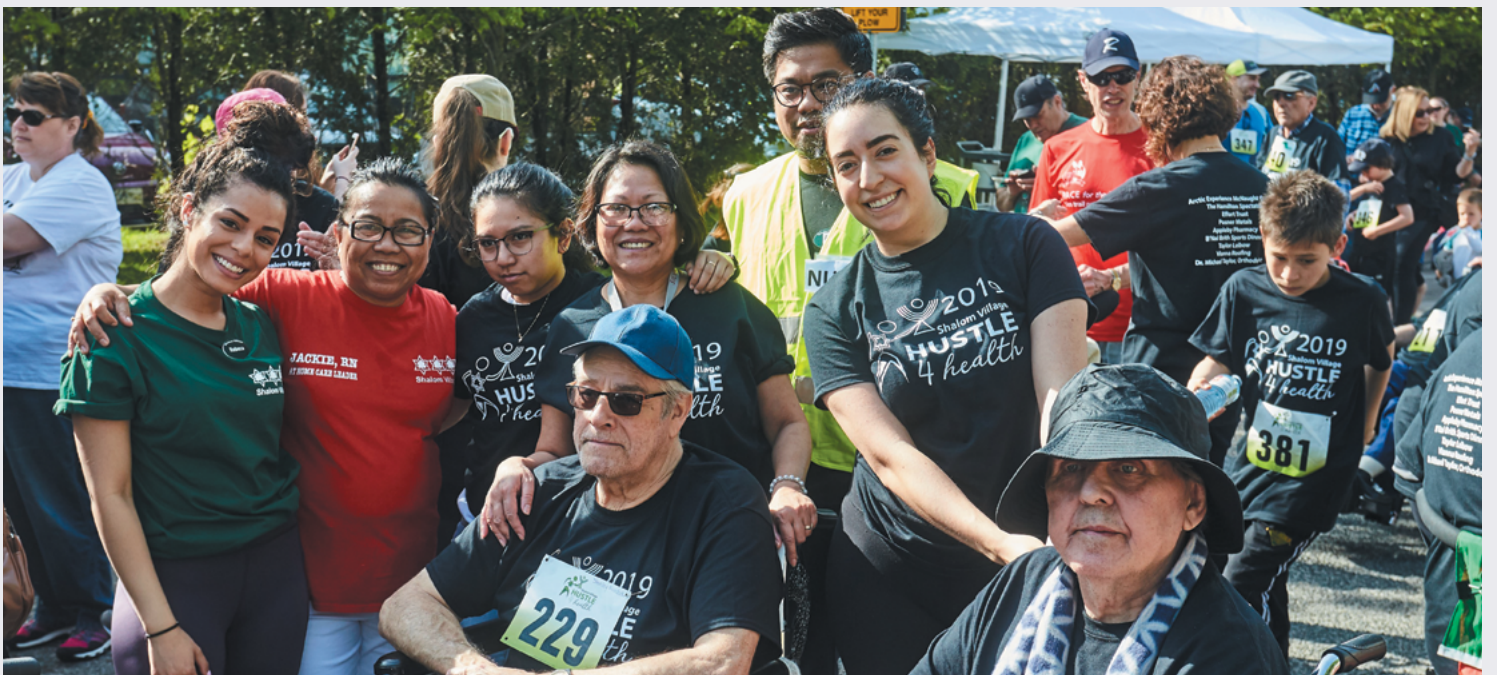
Hustle 4 Health participants, supporting seniors and celebrating families